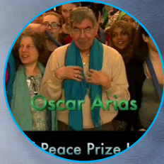
Oscar Arias Nobel Peace Prize Laureate, Costa Rica