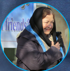
Mairead Maguire Nobel Peace Prize Laureate, Ireland