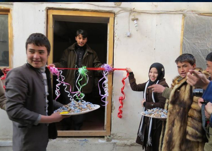
The Opening of APV's Library